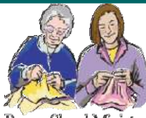
Prayer Shawl Ministry

Do you sew, knit, crochet or quilt? If you do, you can help us with our Prayer Shawl Ministry.