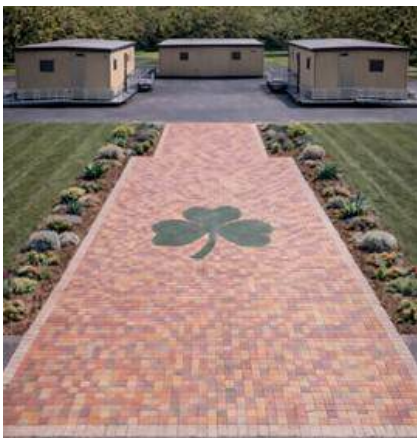
This picture generated for sample/visual purposes only