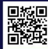
PURCHASE TICKETS HERE