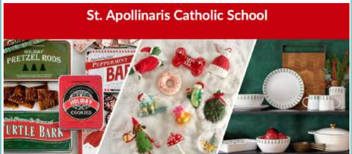
St. Apollinaris Catholic School

St. Apollinaris, mindful of its mission to be witness to the love of Christ for all, admits students of any race, color, and national and/or ethnic origin to all the rights, privileges, programs and activities generally accorded to or made available to students at this school. St. Apollinaris does not unlawfully discriminate on the basis of race, color, national and/or ethnic origin, age, gender or disability in administration of educational policies, admissions policies, scholarship and loan programs, and athletic