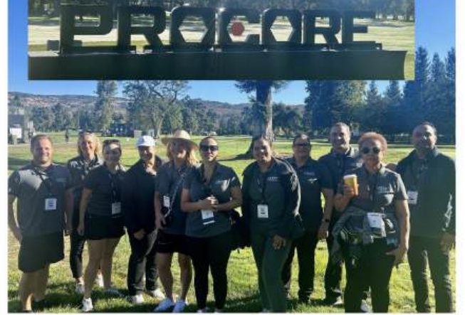
Thank you to all of our wonderful St. A's volunteers working hard at the Procore Championship!

We are currently accepting applications for TK-8 for the 2025-2026 school year. Please visit our website <u>https://stapollinarisschool.org/</u> or stop by the school office Monday through Friday between 8am - 3:30pm